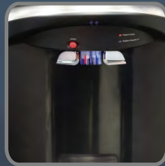
Concealed Water Outlet