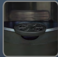
Removable Drip Tray