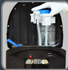
Replaceable Reservoir System SmartFlo™ Water Cartridge